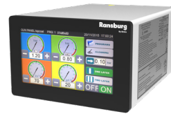
Elite S5 Controller Model 461959