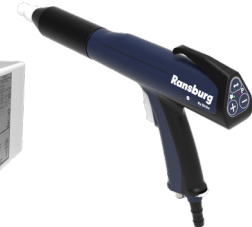
Elite M5 Ergonomic Manual Powder Gun Model 615210