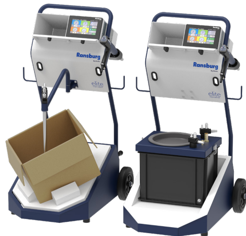
Fluid Hopper Unit Model 805700-FH