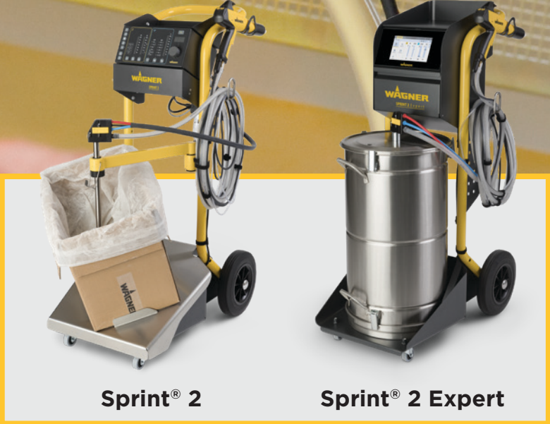
SPRINT ® 2